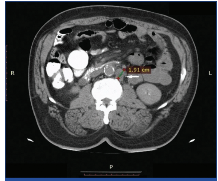
[Table/Fig-2]: Computed tomography axial image showing 19 mm Para-Aortic Lymph Node (PALN) (arrow) in a 46-year-old female with stage IIIC squamous cell carcinoma of the cervix.

[Table/Fig-1]: Univariate analysis of patients' demographic and clinical characteristics *Statistically significant; PALN: Para-aortic lymph node